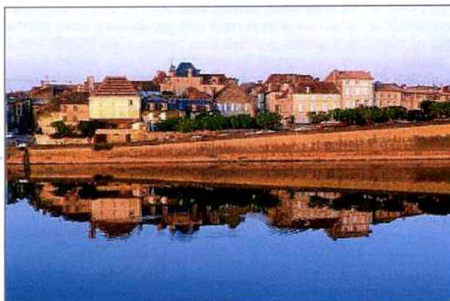
The old town of Bergerac on the Dordogne River.